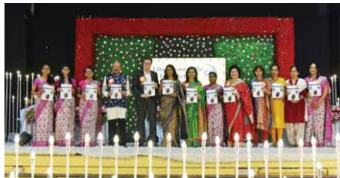
Inspira Release - Volume 54

LPF gives us coat by arranging different developmental programs, industrial visits, make us Peace Ambassadors and so much; but not to freeze. It gives warmth for our future path. The girls who have experienced this warmth, are shining like stars and become scholars; even get placed in different MNCs.