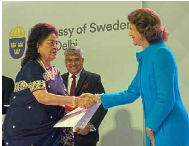
Queen Silvia of Sweden congratulates Padma-Shri Poonawalla for her outstanding efforts in boosting the Indo-Swedish Economic Ties in Maharashtra.

Underneath the 'IHS' are the three gold nails, which symbolize the Crucifixion of Jesus Christ. On the reverse side of the badge, the letters 'FRS' which stand for 'Fredericus, Rex Sueciae' in Latin and 'Frederick King of Sweden' in English are enameled in white color. The letters 'FRS' commemorate the founder of the order King Frederick of Sweden.