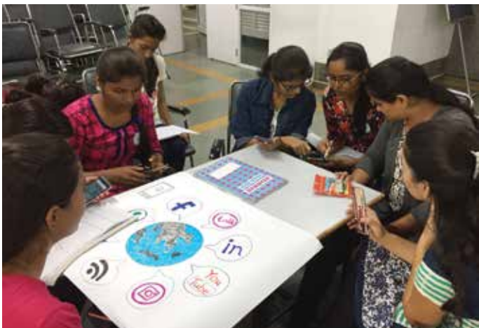
Lila girls involved in the activity of presentation preparation