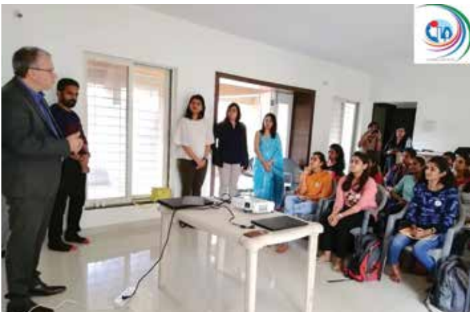
Presentation skills by Dassault Systemes

We are so much thankful to HCL for enhancing their support to LPF. We look forward to stay connected with HCL and to take our partnership to newer heights for years to come.