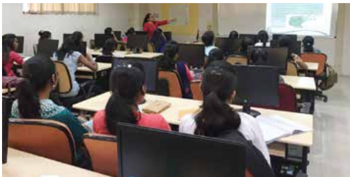
Nursing Lila Girls keenly listening on the topic of burns management