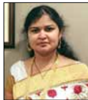
Kumkum Shrivastva LF-2001 Rs. 35,000