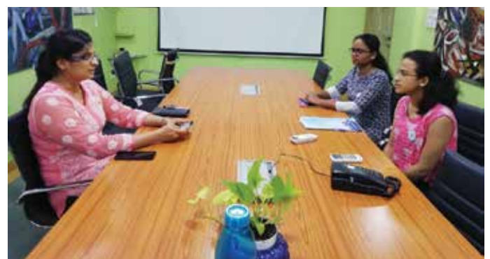
Mock Interview session conducted by Mercedes Benz volunteers