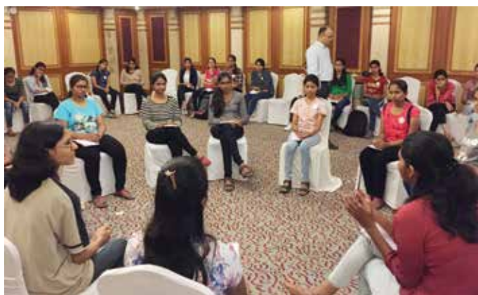
Group Discussion and Interviewing Techniques

The main objective of the program was to build confidence through conversational English thereby strengthening the