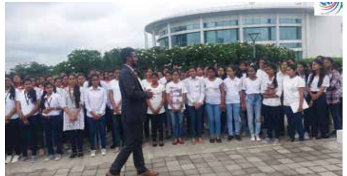
HCL visit at Nagpur

Industrial visit to HCL was highly appreciated by girls who find it full of knowledge. Girls got to know working methodology of MNC Company, how the people are working and gained invaluable industrial exposure on this trip.