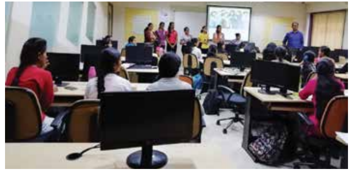
Engineering Lila girls attentive during personality development