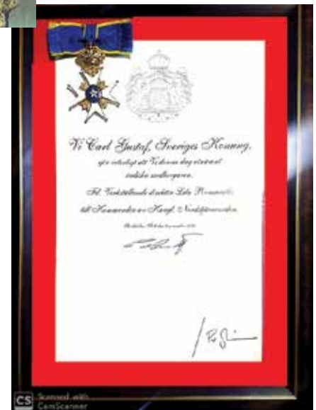
The Royal Order of the Polar Star – Commander 1 st Class ( Royal Order of the Seraphim ) Certificate along with The Royal Order of the Polar Star – Commander 1 st Class Medallion

The Royal Order of the Seraphim, Order of the Sword, Order of the Polar Star, and Order of Vasa, all form the Orders of His Majesty the Swedish King, which currently is King Carl XVI Gustaf.