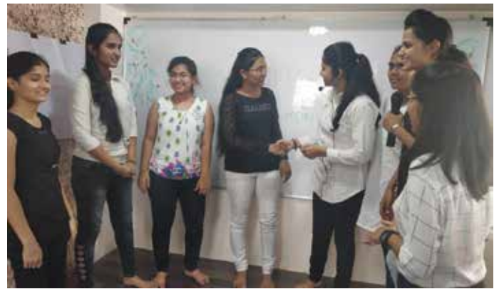
Lila Girls introducing each other during English class