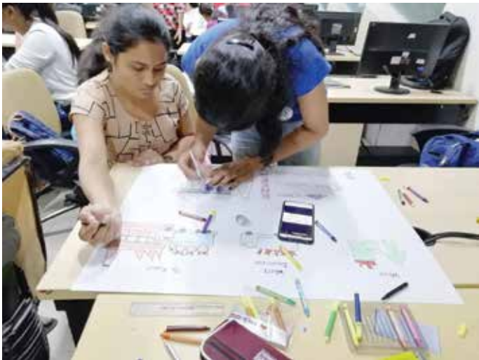
Lila Girls develop the art of conversation in the Scale up workshop