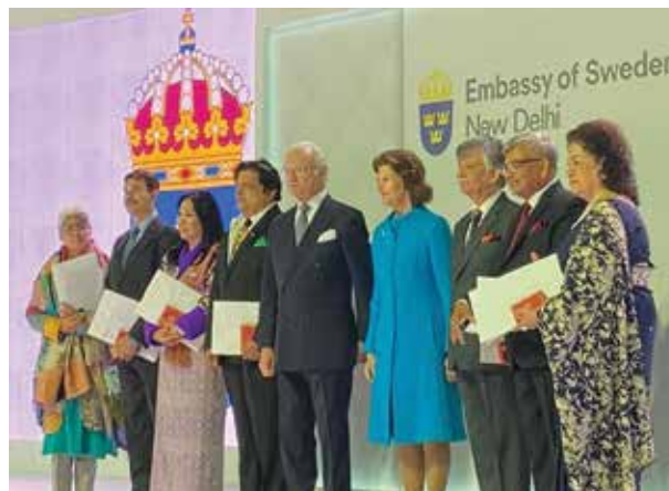
King and Queen of Sweden, along with Mom and other dignitaries.