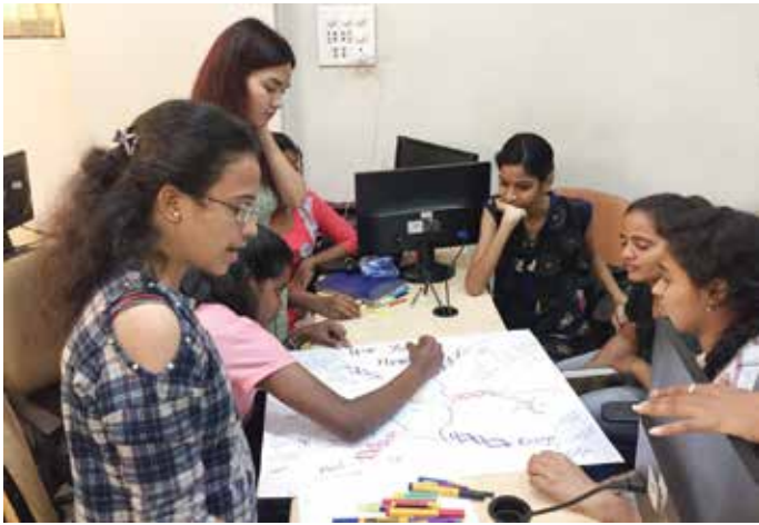
Lila Girls preparing the Mind Maps